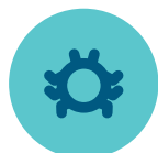
Dust & Storage Mites

Allergens can vary by region and climate, but many common triggers can be found in the home.